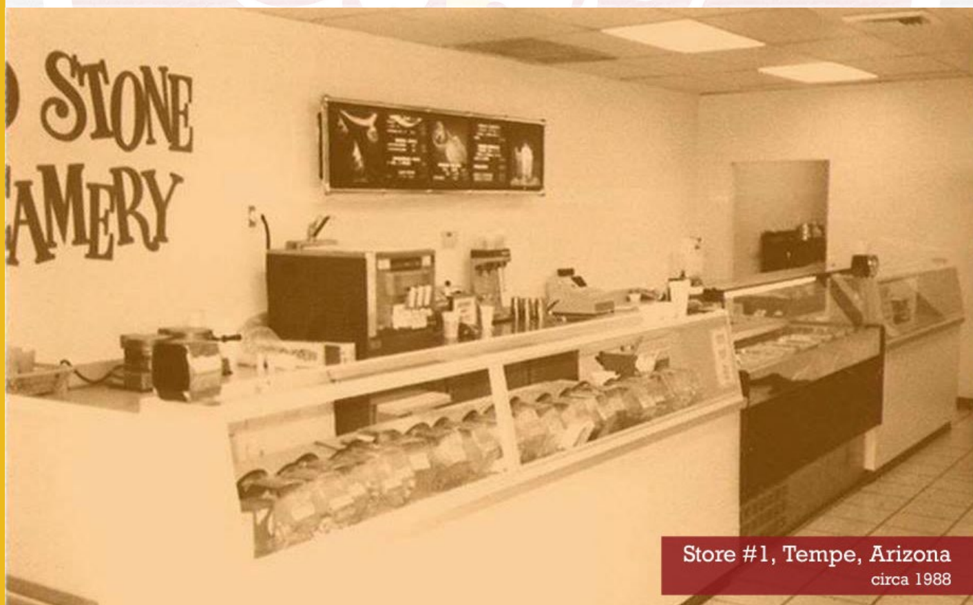
Store #1, Tempe, Arizona circa 1988